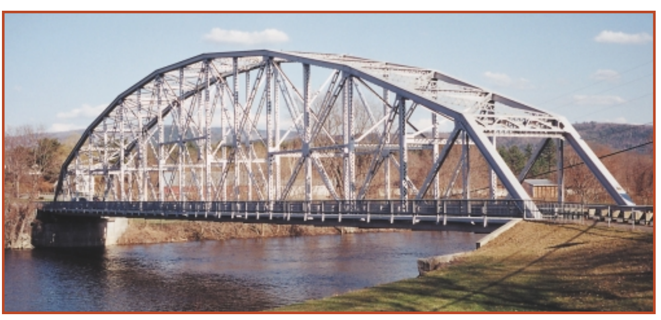
One of the most dramatic bridges constructed after the 1927 flood was the 352-foot Pennsylvania truss span over the Connecticut River from Piermont to Bradford, Vermont, completed in 1929.

The Orford-Fairlee Bridge was thoroughly rehabilitated in 2002-2003. At the same time, the Chesterfield-Brattleboro Bridge was bypassed by a wider arched bridge of