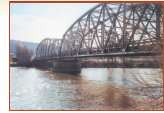
The two-span, 459-foot Parker truss bridge between Lyme and Thetford, Vermont was completed in 1937.