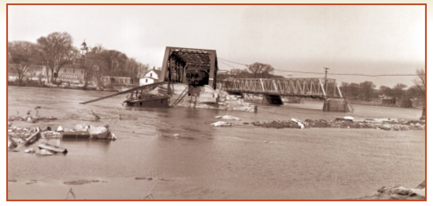
Hookestt was one of the hardest hit communities during the floods of 1927 and 1936. This photo shows the destruction of the Main Street highway and railroad bridges after waters receded in March 1936.

The next "hundred-year" flood did not wait until the year 2028. On March 12, 1936, four days of rain and warm weather freed a heavy blanket of snow and ice that covered northern New England. Smaller rivers like the Saco and the Pemigewasset were the first to flood, causing great damage along their lengths. Then, on March 18, the great rivers of the region broke free of the ice bonds that restrained them.