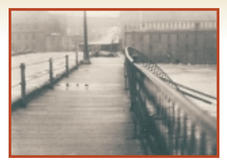
This photo of the McGregor Bridge in Manchester was taken as the span began to break up during the floods of 1936. As debris from this bridge was swept downstream, the Amoskeag Steam Pipe Bridge was also destroyed.

similar design in an unusual tribute to the award-winning earlier structure. The older bridge will eventually be refurbished for local and recreational traffic.